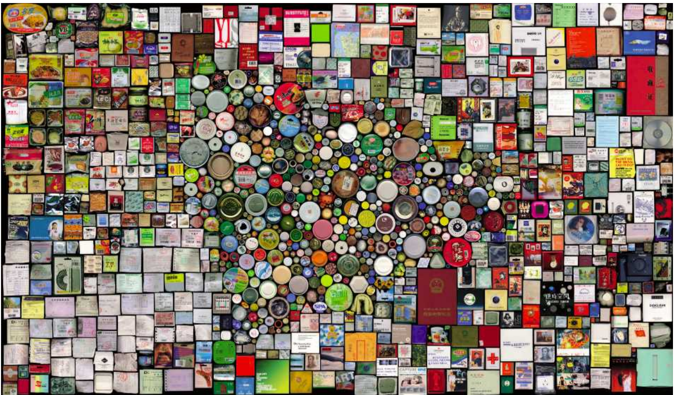
HONG HAO My Things - Book Keeping of 06C, 2007 - Digital print - Ed. of 9 - 120 x 205 cm